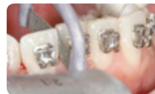
The Orthospace System can be used during treatment.