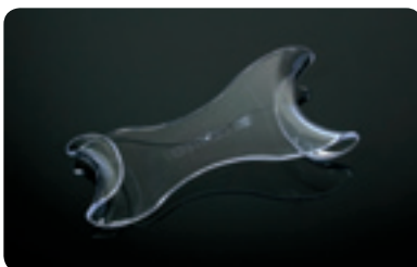
Photo Cheek Retractors Double Ended

Sized for adult or child. Durable plastic design. Sold in pairs.